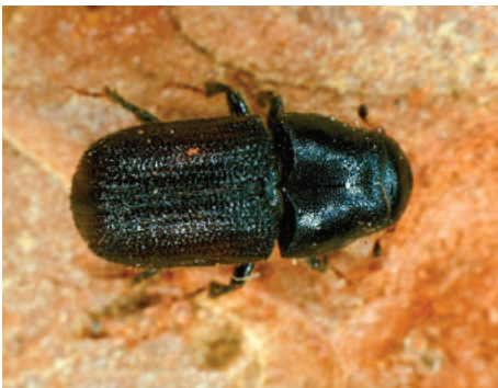
Figure 3: Top view of adult MPB (actual size, 1/8 to 1/3 inch).