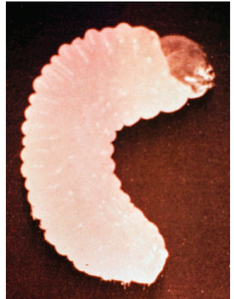
Figure 5: Larva of MPB (actual size, 1/8 to 1/4 inch). They are found under the bark in tunnels.