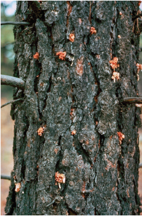
Figure 2: “Pitch tubes” indicating trunk attacks by MPB. Success of the attacks is confirmed by looking under the bark with a hatchet for beetles, their tunnels and/or bluestaining.