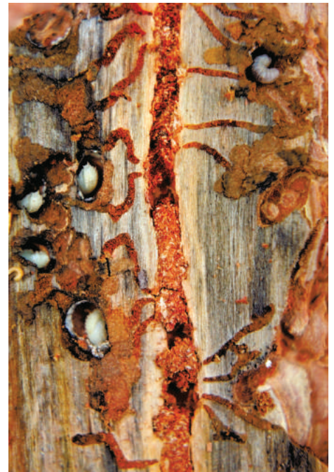
Figure 8: Characteristic tunnels (galleries) of mountain pine beetle made by the adults and larvae. The underbark area looks like this in late spring. Bluestained wood is caused by fungi the beetles introduce.