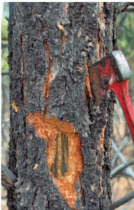
Figure 7: Checking beneath the bark for MPB. This attack was successful (note tunnels and stain).

One very effective way to kill larvae developing under the bark (though very