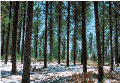
Figure 11: The appearance of a forest thinned to help prevent MPB. This can also improve mountain views and reduce fire hazard.