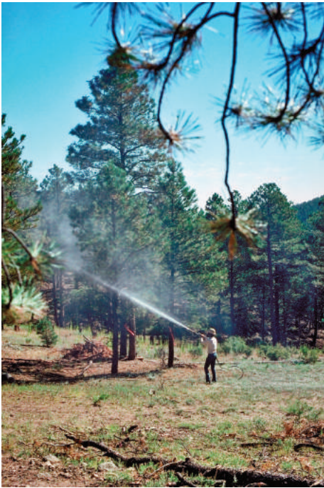
Figure 10: Large, uninfested pine being preventively sprayed. This protects high-value trees and should be done annually between April 1 and July 1.