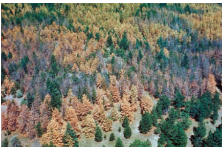
Figure 4: Mountain area infested by MPB, showing three years of mortality. Old, dead trees are gray; newly killed trees are straw yellow or orange. Some trees may also be infested but do not turn color until nine months or so under attack.