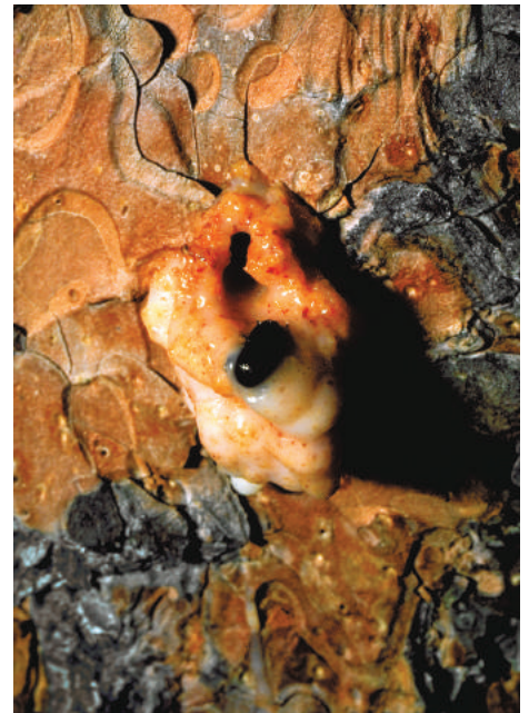
Figure 6: Not all pitch tubes indicate successful attacks. Note the beetle trapped in this large pitch tube. If the majority of tubes look like this, the tree may have survived the current year’s attack.