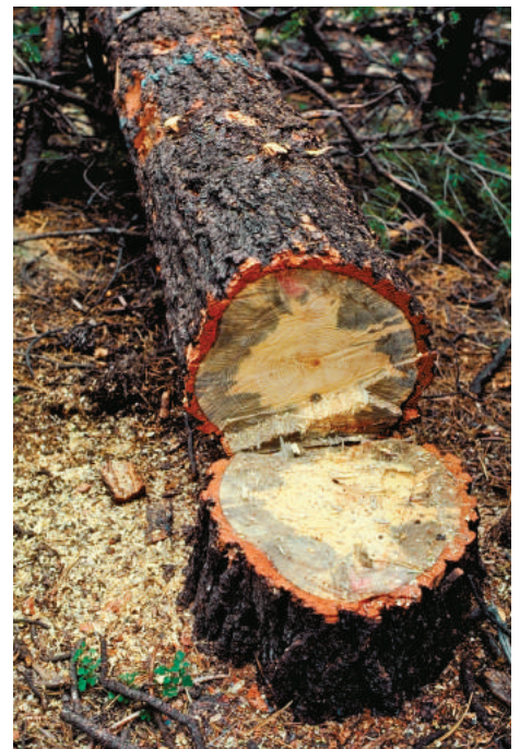
Figure 9: Cut tree killed by MPB, showing the characteristic blue-staining pattern.